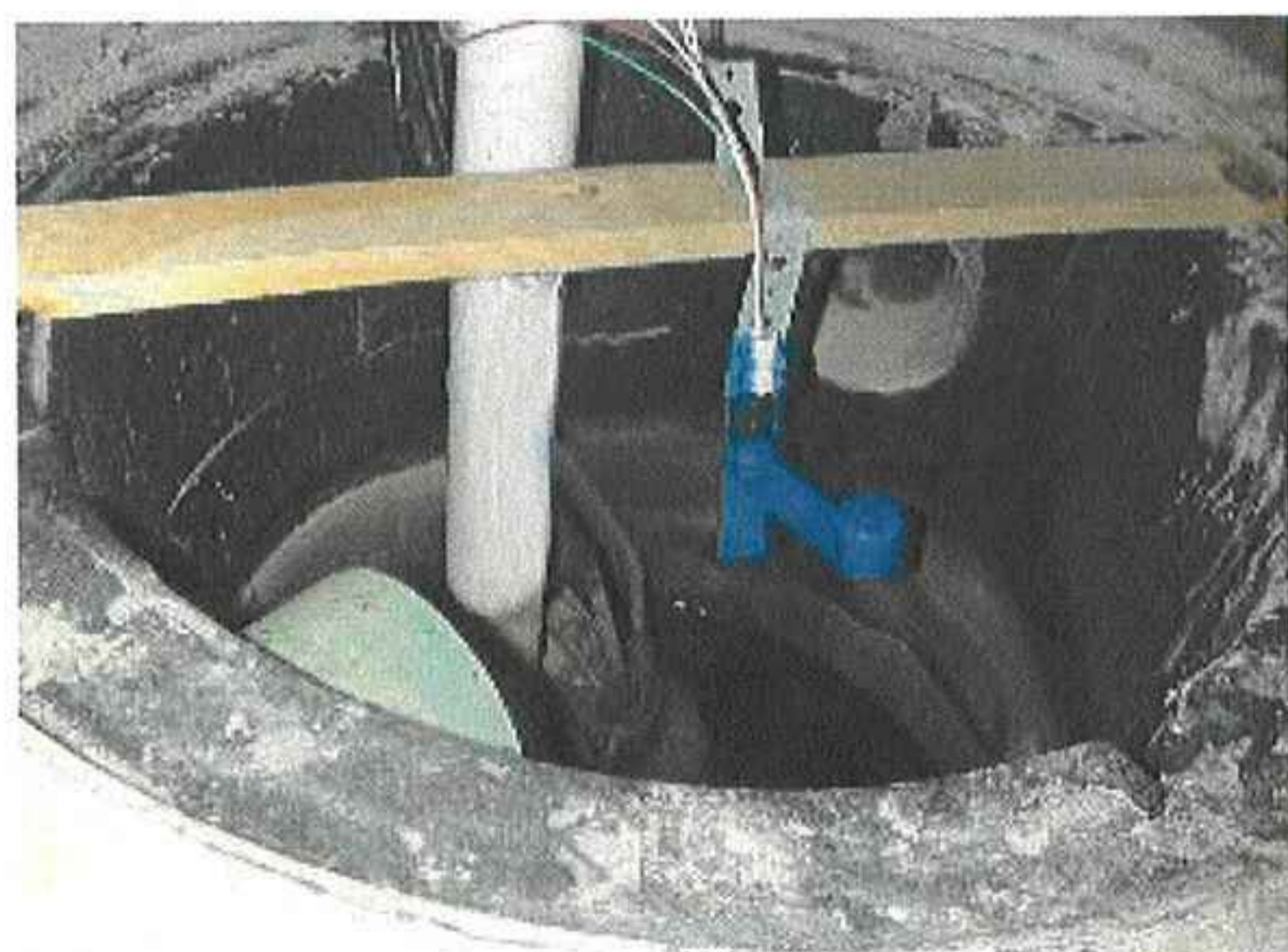
Rear view with pipe strapping attached