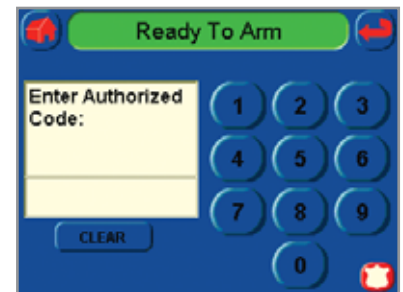
Code Set-Up Screen