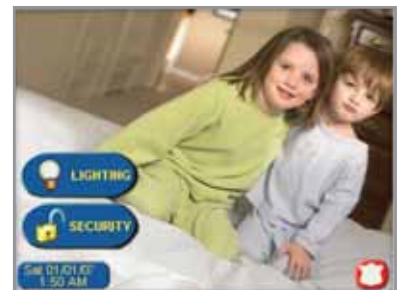
Custom End-User Screen